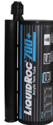
VARIOUS AVAILABLE TWO-COMPONENT CARTRIDGE ADHESIVE